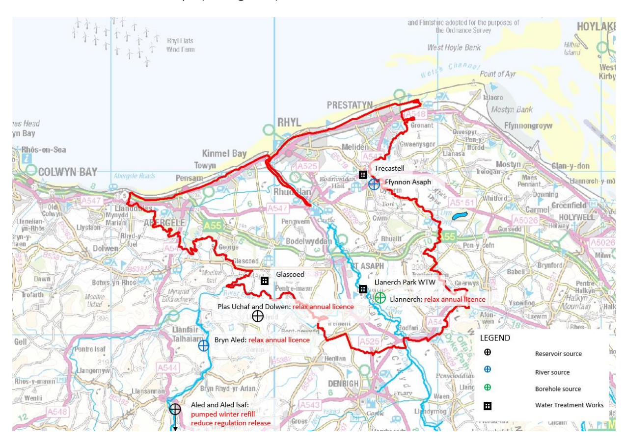
Figure 1 - Map of the Clwyd Coastal WRZ

The Clwyd Coastal Water Resource Zone covers the coastal region from Prestatyn to Colwyn Bay and then further inland to St. Asaph (see Figure 1).